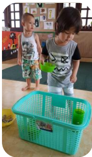
Maxi tidying up his things after snacktime

The children in the Green Group are growing bigger and more capable each day. Even the youngest Kiddies take pride in their ability to do things independently, such as putting on their shoes or tidying up their cup and bowl after a meal. The older children in our class often verbalize how proud they feel when they act independently and tell their friends and teachers, "Look, I can do it by myself!" To celebrate this 'big kid behavior,' we created a photo book of our friends' performing self-help skills and classroom 'jobs' such as the ones below. The children are enthusiastic about looking at this book together in the book corner and pointing out the photos of themselves!