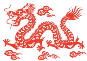
Sleeping Dragon yoga