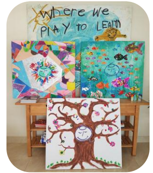
Unique gifts from all 3 locations!