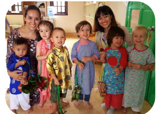
Looking cool in our ao dai

We had a blast celebrating the Mid Autumn Festival together with our friends from the Yellow Group. We looked sharp in our 'ao dai' (traditional Vietnamese outfits) and made our own lanterns to carry during our parade. Our snack time featured a special treat: taro and green bean mooncakes- yum! After all the excitement of the parade and dance party that ensued, we did some 'Sleeping Dragon' yoga to unwind. It was sweet to see how relaxed the children became after just a few minutes of calming yoga with their friends.